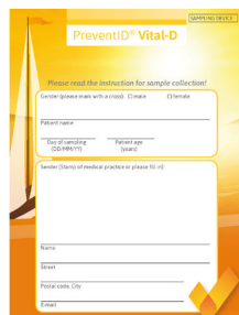
Fig. 1: Sampling device